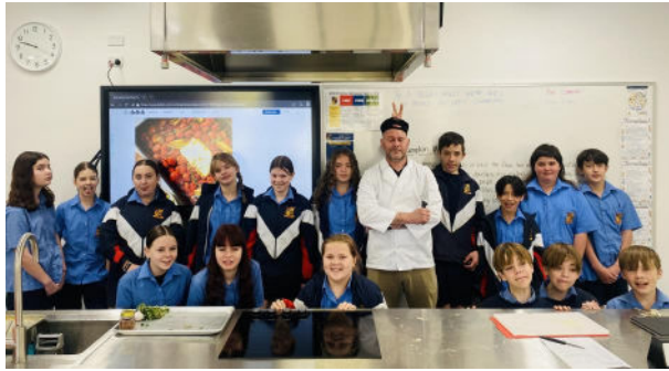
Year 11 Hospitality students made Mocktails