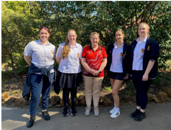
1 - 2025 Student Exec Team